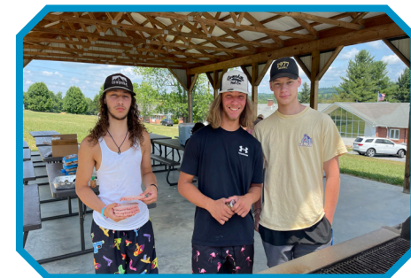
The Boys Preparing to Grill!