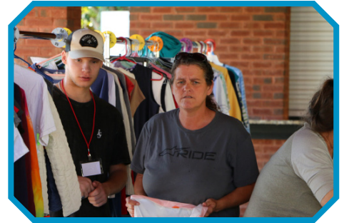
Assisting a Shopper!