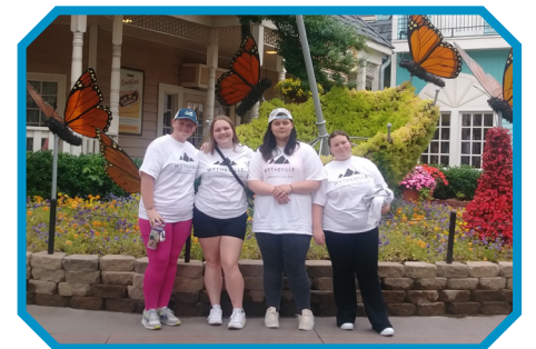
A Day Off Campus!