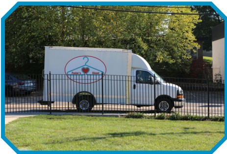
The Truck has Arrived!