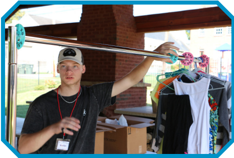
Easton Stocking Clothes.