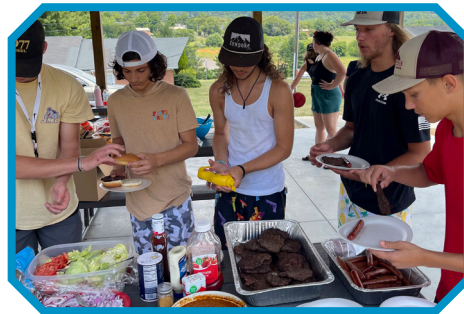
Back to School Picnic!