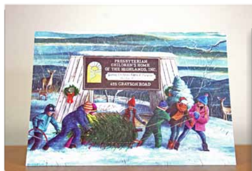
CHRISTMAS NOTE CARDS