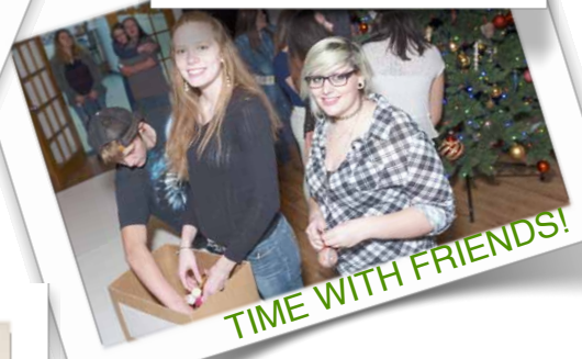
TIME WITH FRIENDS!