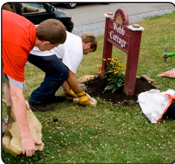
Landscaping can be hot work but well worth it.

For the past couple of years you may have noticed the results we have enjoyed from the efforts of our residents mowing, trimming, and landscaping our campus under the leadership and training from Mr. Cato, one of our Evening Supervisors. Our campus looks great!