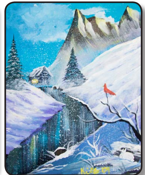
Award Winning Oil Painting

You may find our youngsters involved with sports, music, or art. We encourage active participation in all the activities on campus as well as those available to them at school.