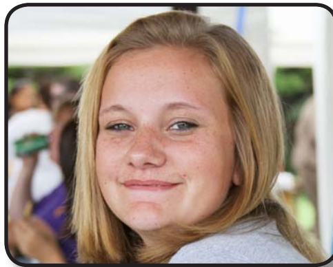
Smiles are contagious!

Our children returned to school with the usual anticipation and trepidation. I think most of us agree on the importance of education and its effect on a child's future. We put a tremendous amount of effort and resources into the educational process. However, in this era of standardized testing and numerous measurements of learning, I think we sometimes lose track of the education that occurs away from the school environment. At the Children's Home, that is what summer is all about.