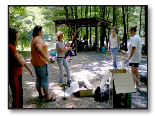
Remember the excitement of camping out? The girls of Buchanan Cottage experienced a taste of enjoying the great outdoors, bugs and all.