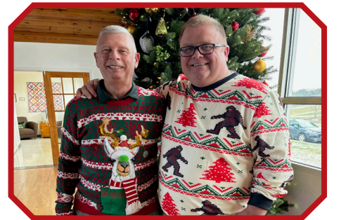
Ugly Sweater Day!