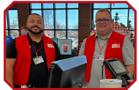
Bagging Groceries for Charity!