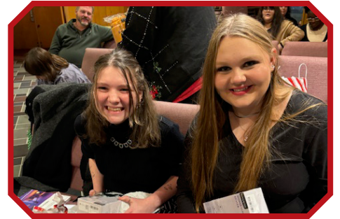
The Girls Enjoying Presents!