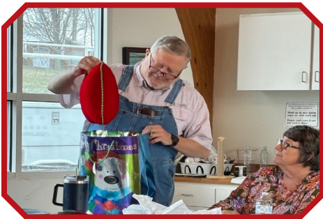
Staff Luncheon Gift Exchange!