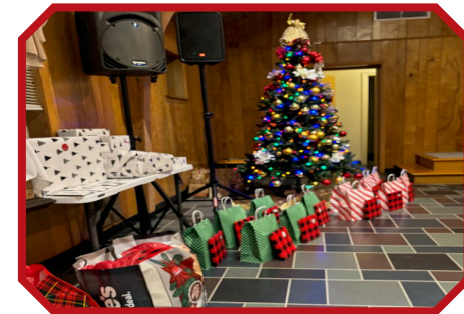
Presents galore thanks to YOU!