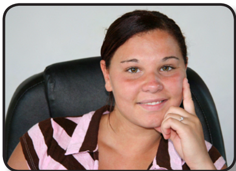
Smiles are contagious!