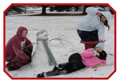
We finally have snow!