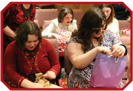
The girls opening their gifts!