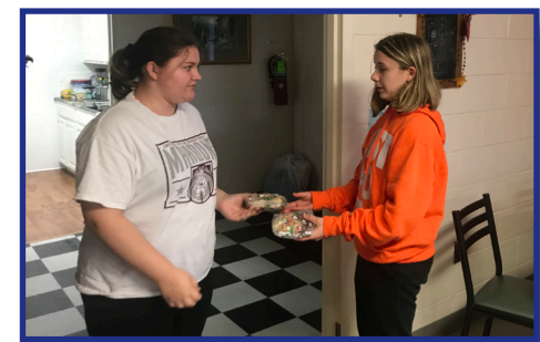
Rural Retreat Lady Indians Basketball delivered homemade cookies to all residents and staff!