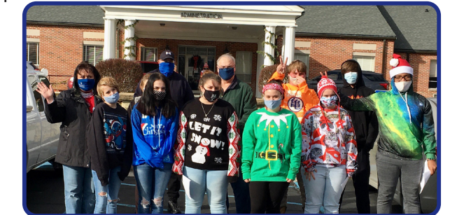
Spreading Christmas cheer by caroling outside of our local Carrington Place Retirement Community. Giving back through a pandemic is truly a blessing.

from both the Home and wonderful supporters like you! Excitement was everywhere as we celebrated Christmas, albeit in a socially distanced manner. We were welcomed to a new tradition following Christmas as an anonymous staff member and their family decided to provide a full steak dinner complete with Ribeye's and all the fixins' for the children and staff on New Year's Eve. This was a huge success and a wonderful surprise and something that the residents will look forward on an annual basis. It's true 2020 was tough and is behind us, but it has blessed us with a sense of family that otherwise could have slipped through our fingers. Thank you for being with us during this time and continuing your unwavering love and support!